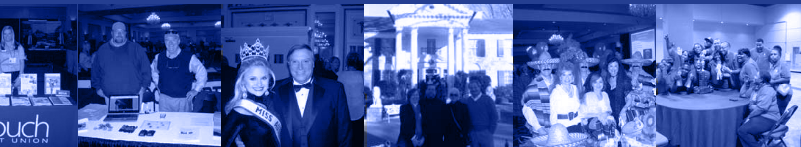
Membership Listings with Contact Information