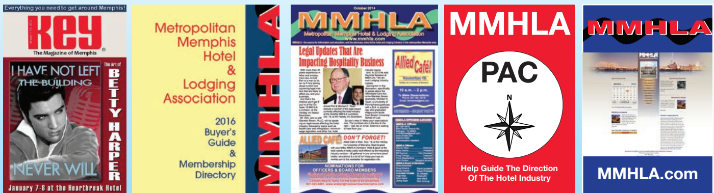
Hotel listing in Key Magazine & Map Location

Contributions or gifts to the Memphis Hotel & Lodging Association are not tax deductible as charitable contributions for federal income tax purposes. However, dues payments or assessments are deductible by members as an ordinary and necessary business expense.