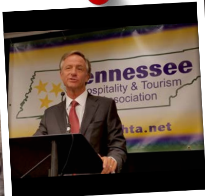
Tennessee Governor Bill Haslam giving a speech and the Day on the Hill