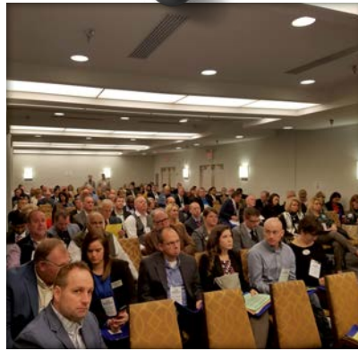
All of the folks in attendance at the Day on the Hill conference